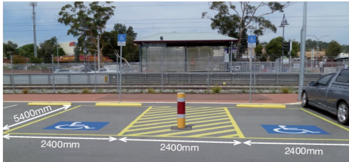
ACROD parking bays with shared space, ground markings and bollard