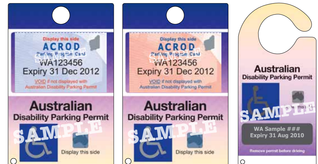
New Australian Disability Parking permit