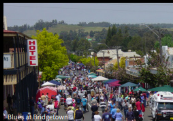
Blues at Bridgetown